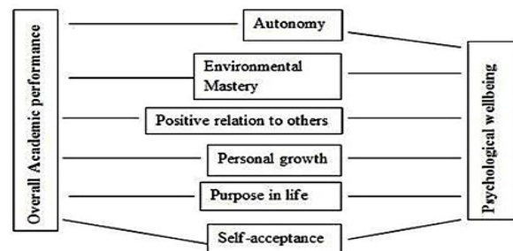
Figure-1: Conceptual framework of study

Learners' psychological wellbeing (PWB) has multiple links with the academic performance. Yet most of the studies on psychological wellbeing have not cited the correlations of six dimensions (of PWB) with overall educational performances. Such larger scales studies were needed in Pakistan region to assess this relation. This study fills the gap in the empirical understanding of the relationships between medical students' psychological wellbeing and overall academic performance. Figure-1 shows concept of study.